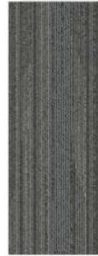
Victory Heights 872