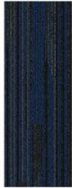
Victory Heights 858