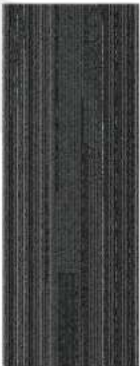
Victory Heights 875