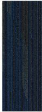
Victory Heights 857