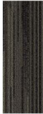
Victory Heights 848