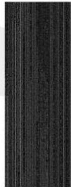
Victory Heights 876