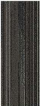
Victory Heights 873