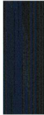
Victory Heights 856