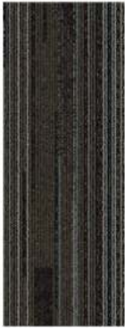
Victory Heights 846