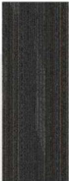
Victory Heights 877