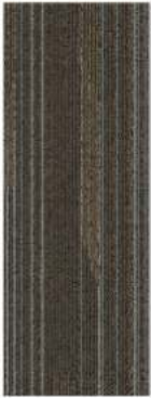
Victory Heights 845